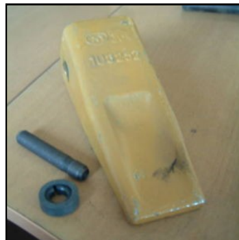
Replace-able tip systems, including Caterpillar, Esco Bofors, and many others available, if not in stock we can source within a few days