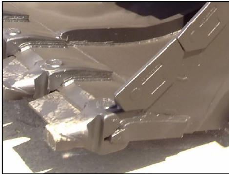
Bolt on teeth and side cutters for mini and midi excavator buckets inc. Kubota , JCB and MF style teeth