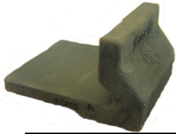
Heel Shroud castings for extra protection to the lower side and outer floor areas