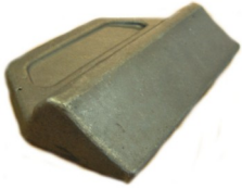
Blade savers for extra protection between the teeth and up the sides

We carry stocks of many types of teeth and wear castings